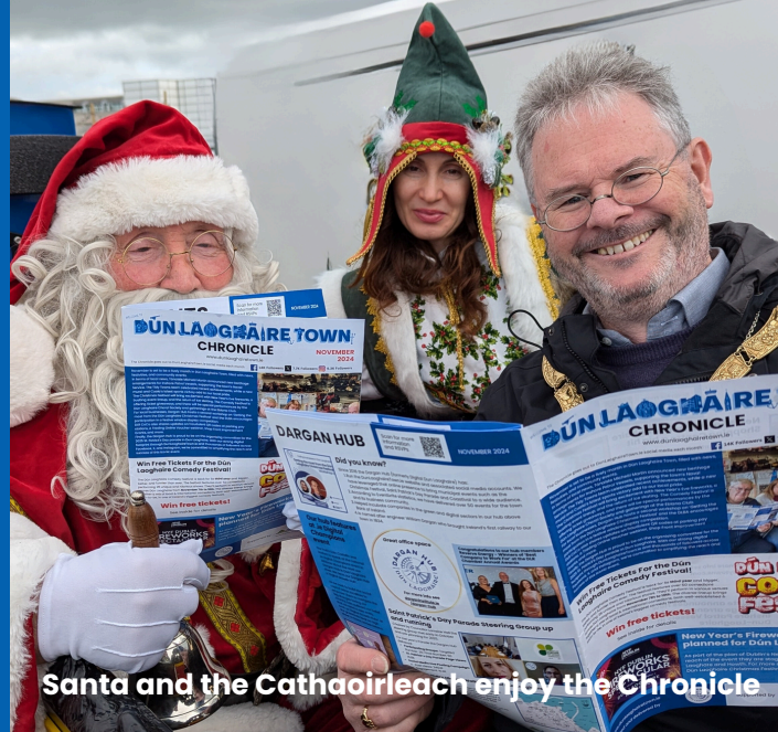
Santa and the Cathaoirleach enjoy the chronicle

In community updates, locals celebrated a successful Santa Parade and a new scenic cycling route to Bray is under discussion. New outdoor showers have been completed at the Forty Foot for our brave sea swimmers! The iconic 46A bus service transitions to the E2, marking the end of an era. The St. Patrick's Day Parade Committee is already planning for 2025, while businesses can access shopfront improvement grants and join workshops to maximize the festival's benefits. Dún Laoghaire remains a hub of holiday magic and community spirit, come and join in!